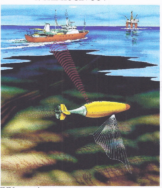
Fig.1. The HUGIN UUV operation concept

The HUGIN UUV development is a co-operation between the Norwegian Defence Research Establishment, Statoil, NUI, and Kongsberg Simrad. At the present time 2 vehicles have been produced (HUGIN I and II for max 600m water depth), and a new version is in production (HUGIN 3000) for max 3000m water he operating concept is illustrated in figure 1. HUGIN is a battery operated free swimming vehicle. It is linked to its mother vehicle by 4 acoustic connections: